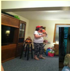
August Picnic & Auction